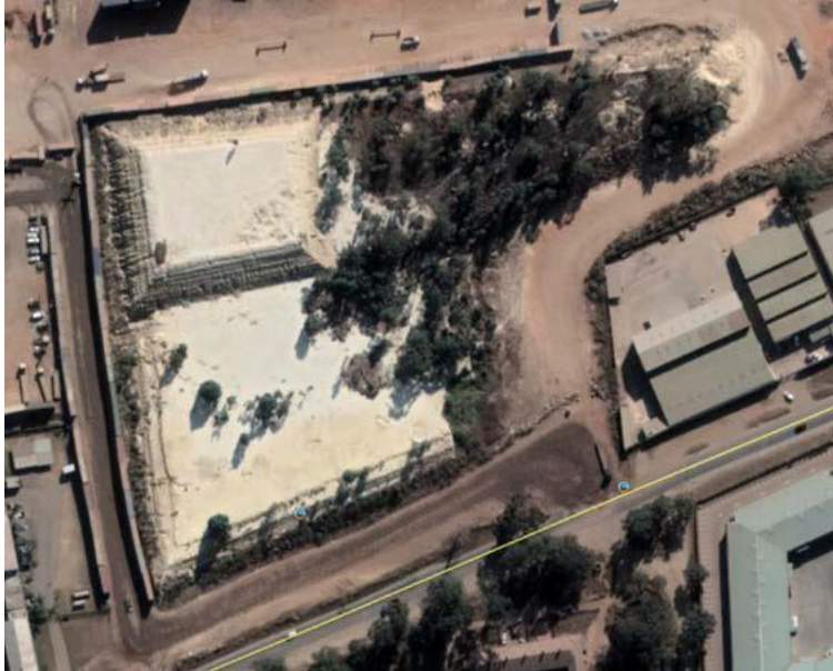
Figure 1 Aerial photo of the tailings site